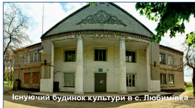
Існуючий будинок культури в с. Любимівка