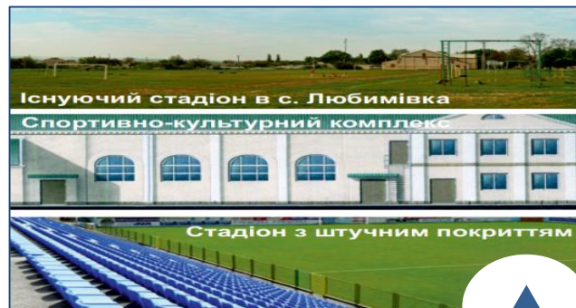
Існуючий стадіон в с. Любимівка