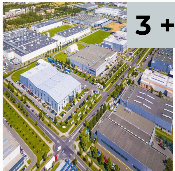
IP + IDT*